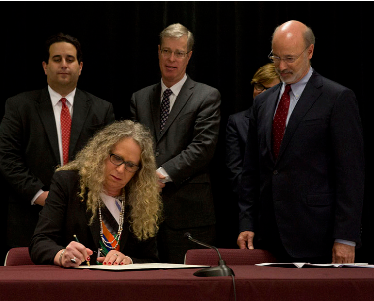
Pennsylvania Governor Tom Wolf pictured with his Pennsylvania Physician General Rachel Levine — the first ever transgender Physician General.

“support individuals using the facility that corresponds with their sex at birth or the facility with which they individually identify,” 56 percent chose “birth sex” and just 31 percent “personal identification.” Only 7 percent of Pennsylvania voters support using puberty-blocking drugs in children with gender-identity issues. Some 59 percent opposed it. Seventy-one percent said they were less likely to vote for Gov. Tom Wolf once they learned about his transgender extremism.